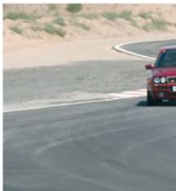
Guadix race circuit: Fast and fun driving

To book for the July 4 event call 0034 952 838 693 or 0034 667 204 629 or email info@trackdaysspain.com . For more information visit the website www.trackdaysspain.com