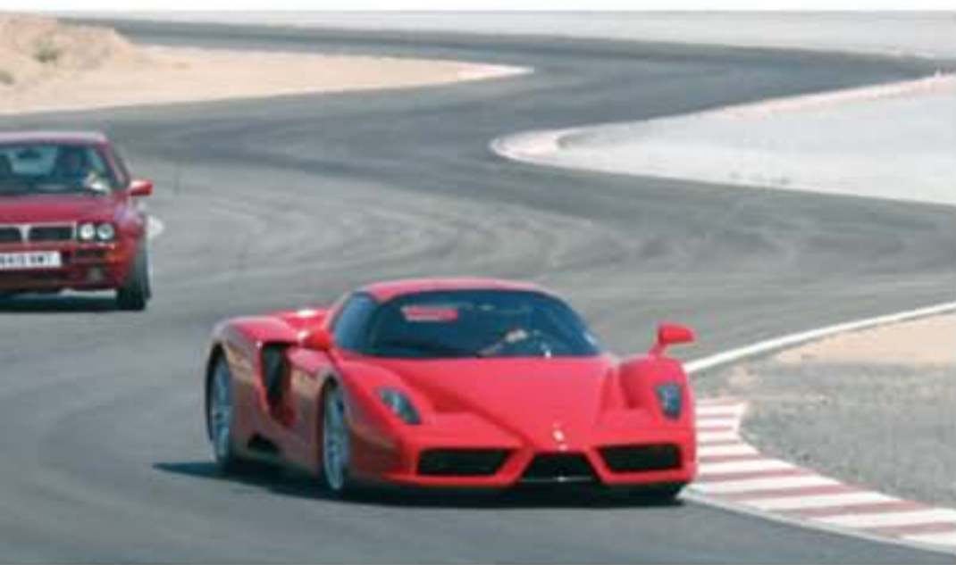
g round a first-class track.